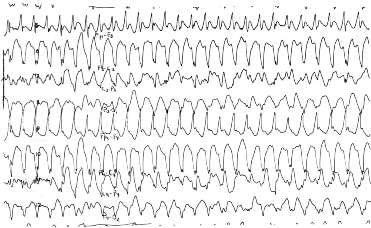
FIGURE 11-1, A Symmetrical 3-cps spike and wave pattern in a child with absence seizures.